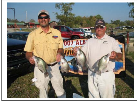
3 rd Place- Steed & Steed